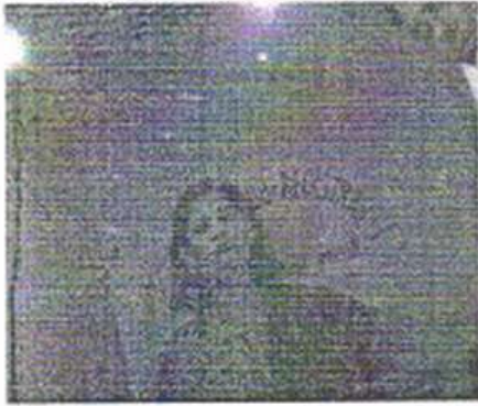
Ist Party न्यासकर्ता

Reg. No. 5362 Reg. Year 2009-2010 Book No. 4